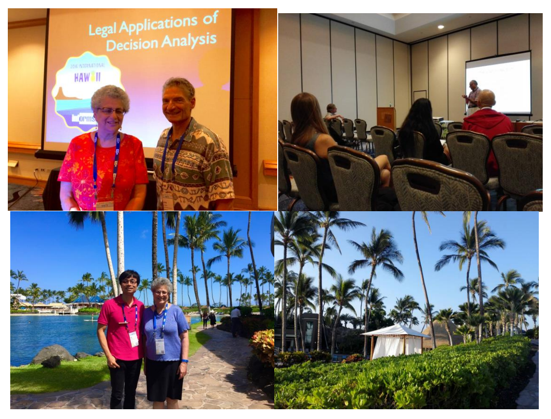
2016 International Decision Conferencing (IDCF) Review

The following pictures show DAS members at the conference presentations and with the fabulous scenery in sunny and breezy Hawaii.